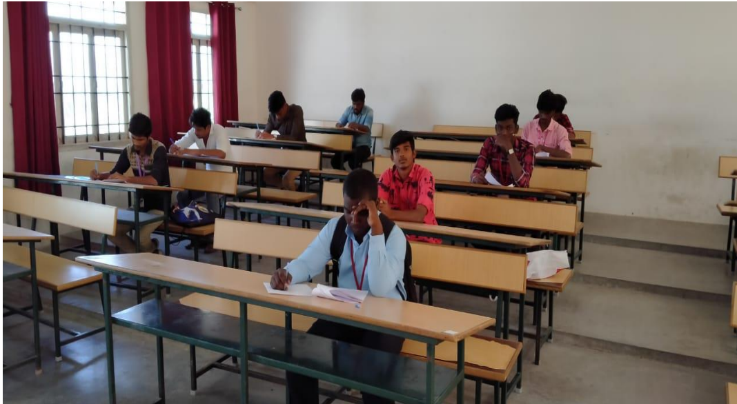
Event 3: Technical Quiz