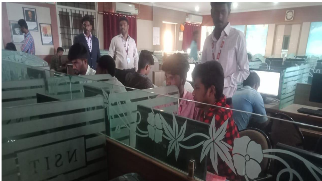
Event 2: 3D Modelling