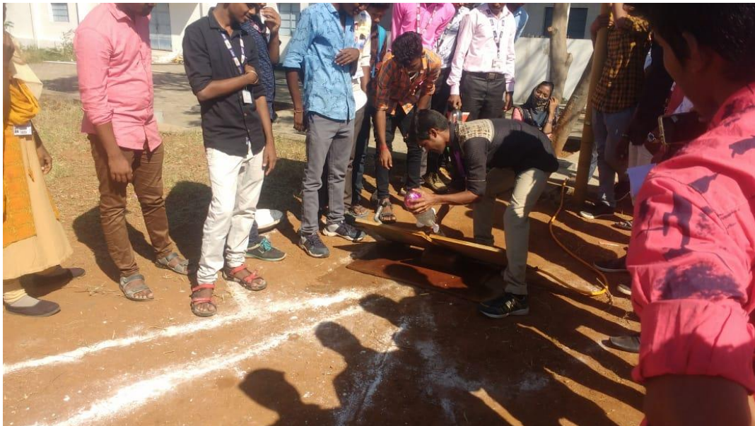
Event 4: Water Rocketry