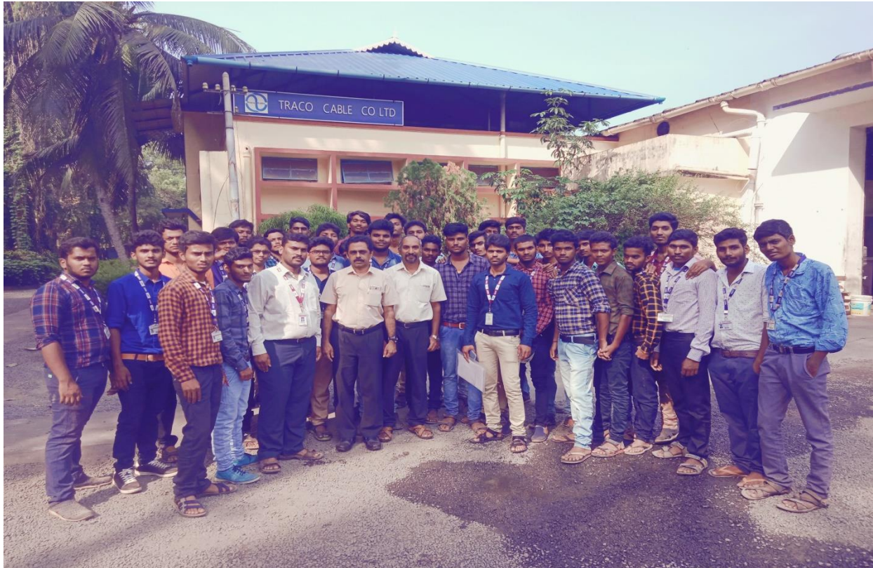
Fig. Industrial visit to Traco Cable Co Ltd